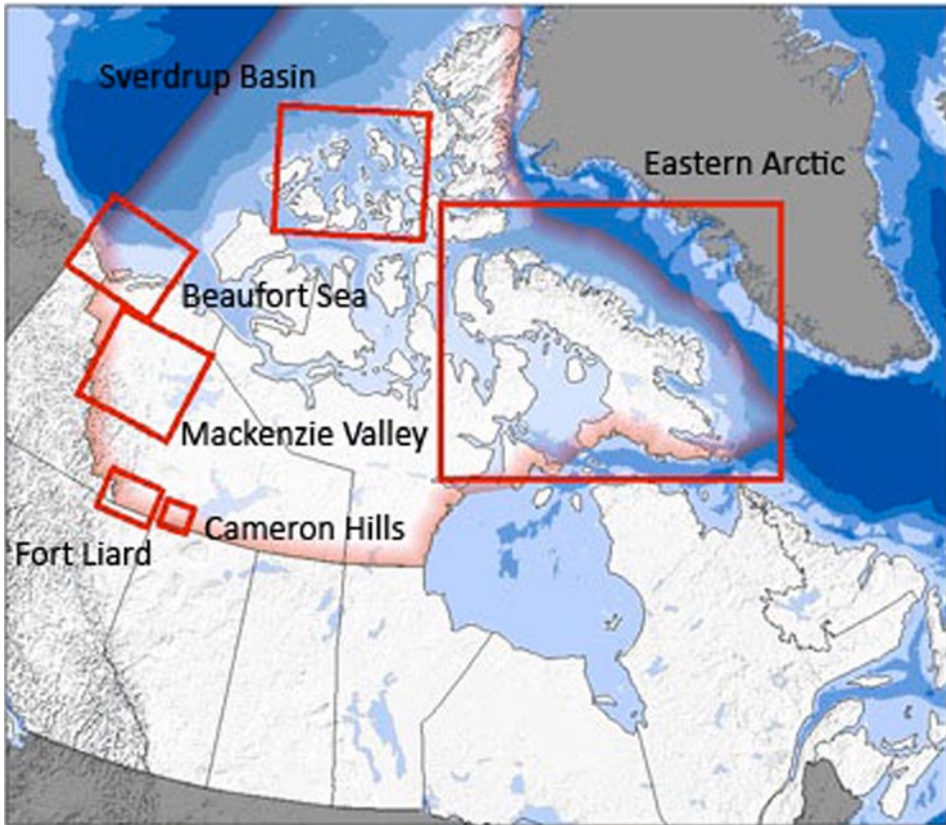
Fig 1: Canada's Northern Oil and Gas Regions